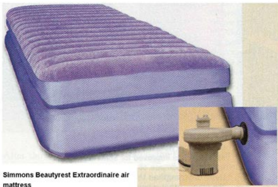
Simmons Beautyrest Extraordinaire air mattress

allow use of manual pumps for when you are not near all electrical outlet.