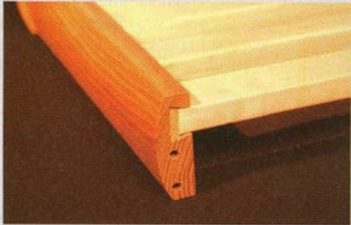
Examples of how the quality of construction has improved for some futon frames include use of dovetail joints (left) to strengthen the assembly of the piece. Other manufacturers have designed in the ability to easily replace the slats (top, left) of frames. Among them, August Lotz (Boyd, Wis.) also incorporated a system (top, right) that allows soiled/damaged arm tops to be easily detached and swapped with replacements the company sells.

this to their being lightweight and how quickly they setup and you've got the makings for a category that's ready to come out of its slumber.