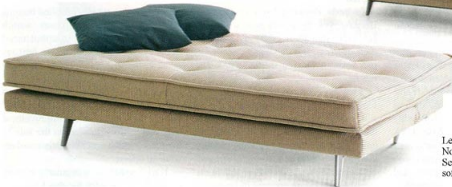
Left and above: Ligne Roset Nomade Express. Below: Sealy Posturepedic sleeper sofa.